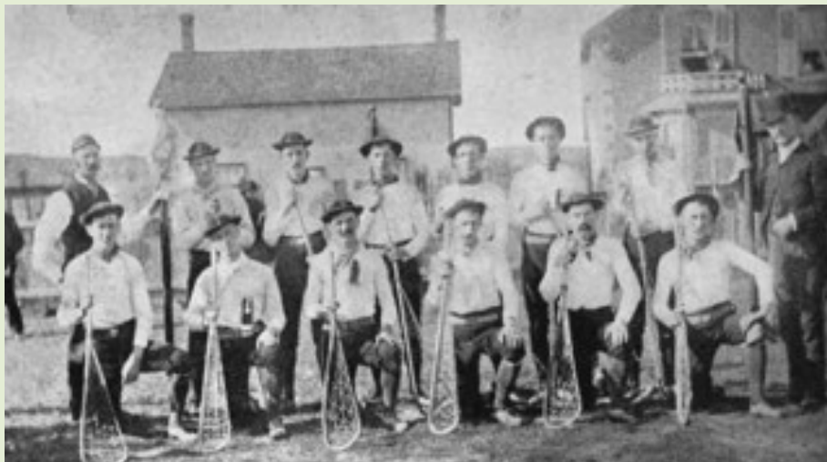
Richmond Hill, Ontario, Canada, “Young Canadians” lacrosse team circa 1885.